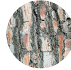
Maritime Pine Bark Extract