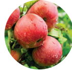
Apple Fruit Extract