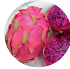
Natural Dragon Fruit Flavor