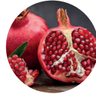
Pomegranate Fruit Extract