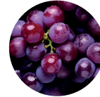
Grape Seed Extract