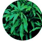
Mango Fruit Extract