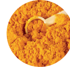
Calcium Pantothenate (Vitamin B5)