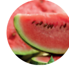
Natural Watermelon Flavor