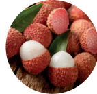
Lycium Barbarum (Goji fruit)