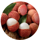
Lycium Barbarum (Goji fruit)