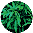
Mango Fruit Extract