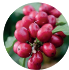
Coffea Arabica (Caffeine)

Sweetener: xylitol, flavouring, acidity regulator: citric acid, black chebulic ( Terminalia chebula ) fruit extract, acidity regulator: malic acid, colouring food: turmeric ( Curcuma longa ) rhizome powder, isomalto-oligosaccharide, mango ( Mangifera indica ) fruit extract, sweetener: steviol glycosides from Stevia, caffeine (from Coffea arabica beans extract), anti-caking agent: silicon dioxide, safflower seed oil ( Carthamus tinctorius ), frankincense ( Boswellia serrata ) gum-resin extract, goji ( Lycium barbarum ) fruit extract, colour: beetroot Red.