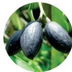
Black Chebulic Fruit Extract